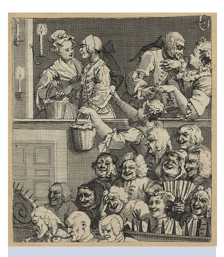
Photo: The Laughing Audience (or A Pleased Audience), by William Hogarth